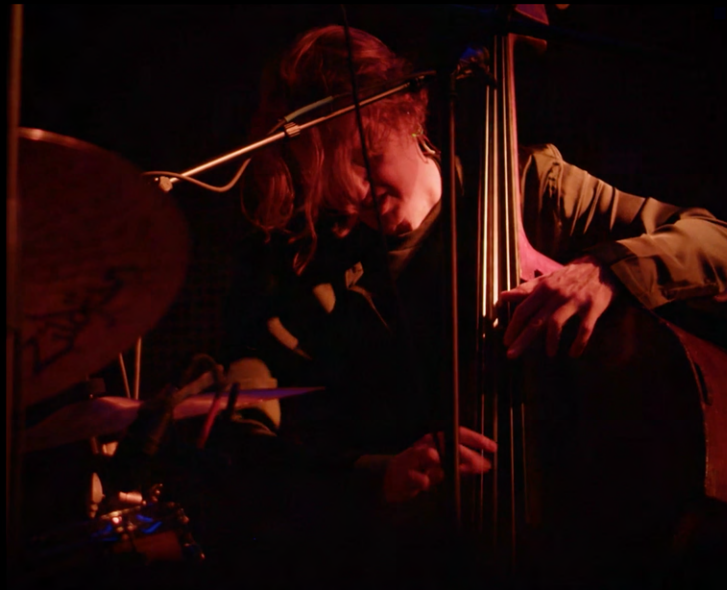
RICHARD REED PARRY (ARCADE FIRE) & SUSIE IBARRA

We can capture the whole show with multiple cameras and a studio quality mix, or simply shoot with a single camera to capture amazing moments depending on budget and desire.