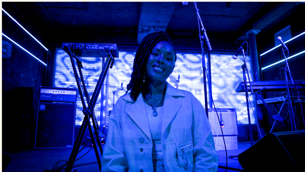
TANGINA STONE: LIVE UNDER A PISCES MOON promoting her upcoming record Pisces (Warner/ADA)

Give essential context around your art while promoting your latest record, project, collaboration, or show through an engaging visual story.